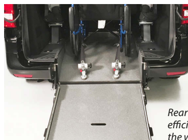
Rear securement retractors are efficient and easy-to-use in securing the wheelchair and passenger.