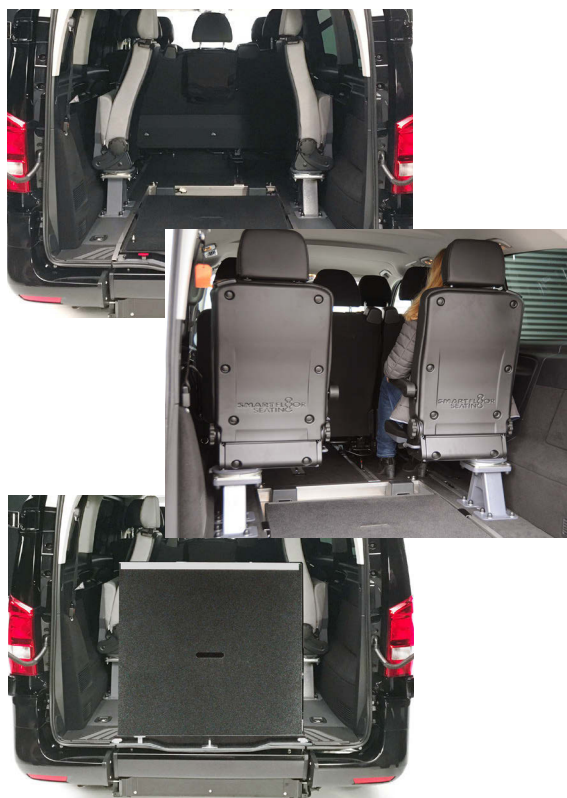
Top: ramp in flat cargo position with third row seats stowed.

The Metris WAV comes equipped with an automatic tensioning system that assists with loading and unloading a wheelchair passenger. Our optional 'Easypull' winch system is also available to pull the wheelchair and passenger up the ramp in to the vehicle.