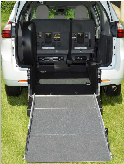
Ramp deployed for wheelchair access.

Installed in hundreds of vehicles since 2014, our exclusive FlexFlat ramp system is an innovative design that folds flat when not in use. It's there when you need it, and folds out of the way when you don't. FlexFlat creates a usable deck that's perfect for luggage, boxes, golf clubs and more.