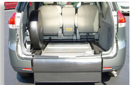
Ramp folded forward with flat deck.