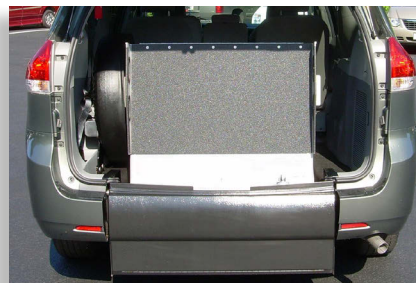
FlexFlat ramp in vertical stowed position.

Installed in hundreds of vehicles since 2014, our exclusive FlexFlat ramp system is an innovative design that folds flat when not in use. It's there when you need it, and folds out of the way when you don't. FlexFlat creates a usable deck that's perfect for luggage, boxes, golf clubs and more.