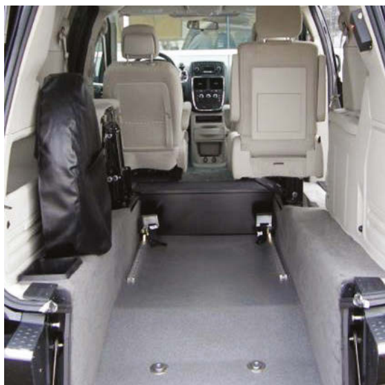
A full cut floor is shown with two 2nd row fold-out bucket seats. The 2nd row seat on the left is in its folded, stowed position.

The country's best-selling minivan is made accessible for taxi, transport, healthcare and more!