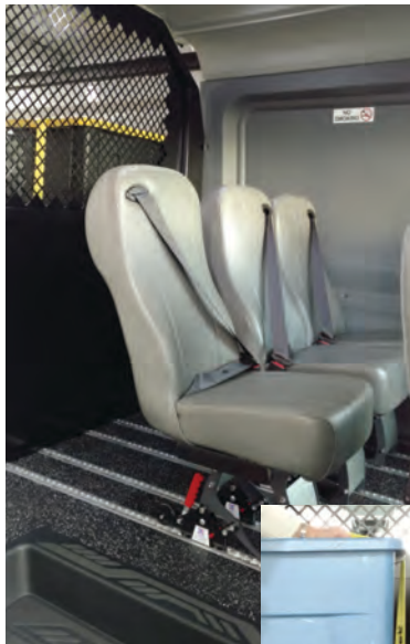
ABS wall, headliner, and SmartFloor removable seats shown in front of the cargo partition.