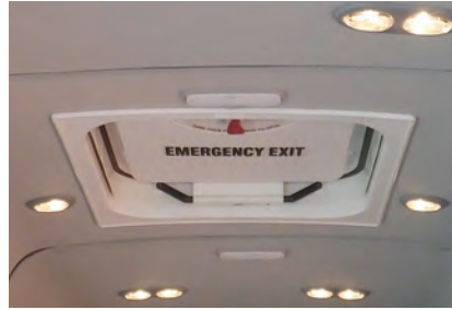
Emergency roof hatch (in solid or clear options)