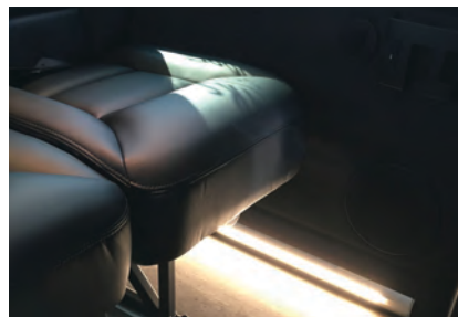
Optional lower sidewall lighting