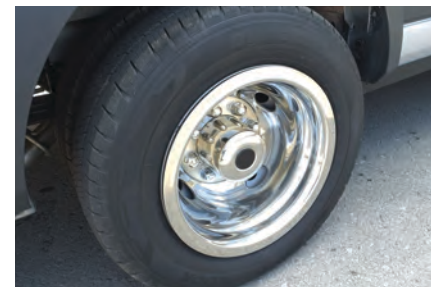
Stainless steel wheel covers