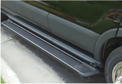
Molded wide step running boards.