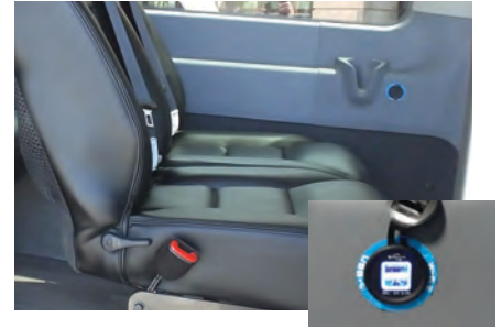
Backlit dual USB ports