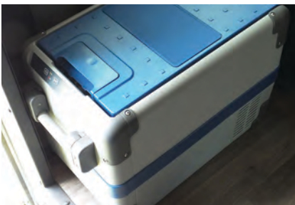
Optional 12V electric powered cooler