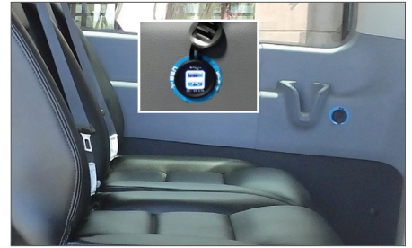
Passenger accessible USB ports