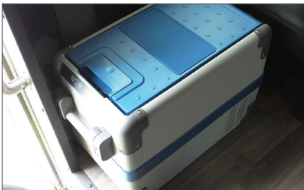
Optional 12V electric cooler