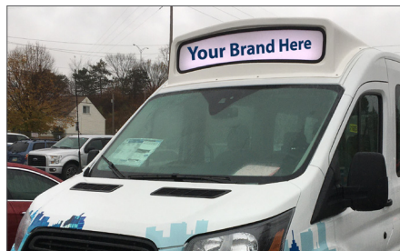
Help travelers identify your vans while building brand awareness with customized van marquees.