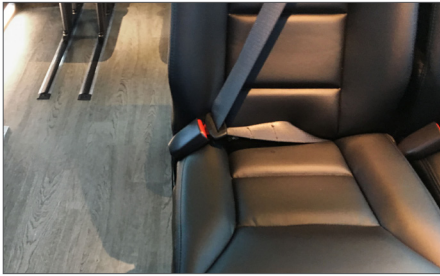
Black Trieste leathermate seats on Manor Oak wood grain flooring