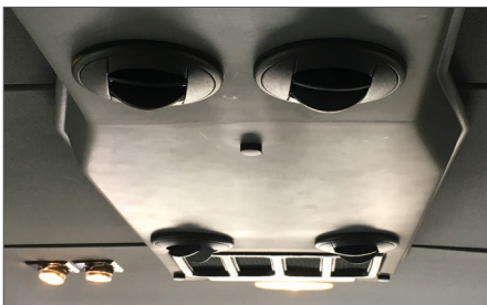
Mercedes Sprinter: High capacity roof-mounted AC