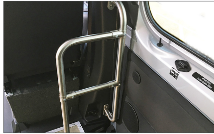
Entry-way passenger rails