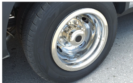
Stainless steel wheel covers