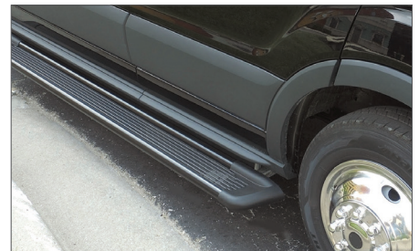
Ford Transit: Molded wide step running boards