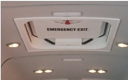
Emergency roof hatch (solid or clear)