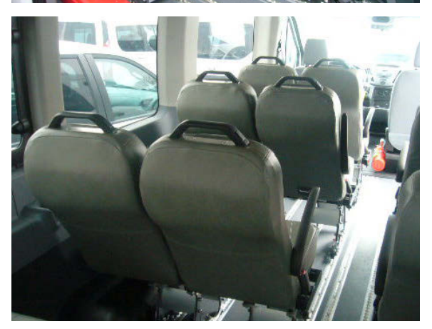
Our SmartFloor flexible flooring system provides hundreds of seating layout options to meet changing ridership needs.