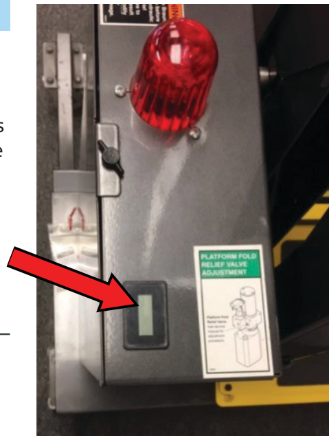
Cycle counter location on a wheelchair lift.

Online videos are available at: Driverge.com/support/product-training-videos