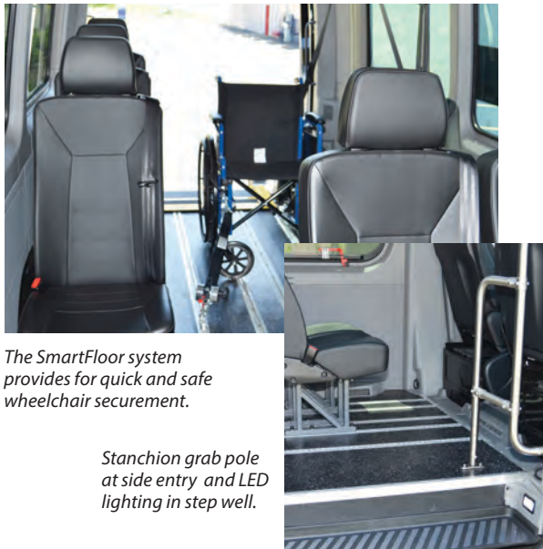
The SmartFloor system provides for quick and safe wheelchair securement.