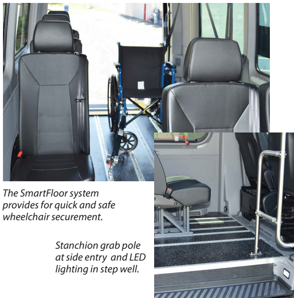
The SmartFloor system provides for quick and safe wheelchair securement.