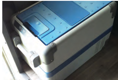
Optional 12V electric powered cooler