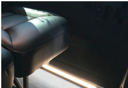
Lower sidewall lighting