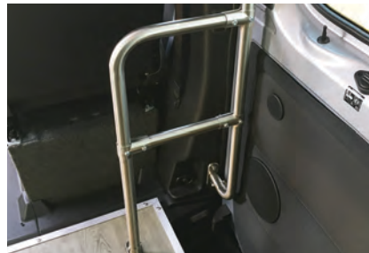
Passenger entry stanchion pole