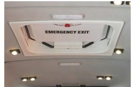
Emergency roof hatch, when required, is available in solid or clear options.