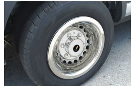
Stainless steel wheel covers