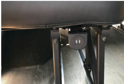
USB ports under each seat