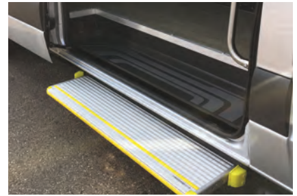
Power step running boards