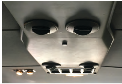
High-capacity roof mounted AC