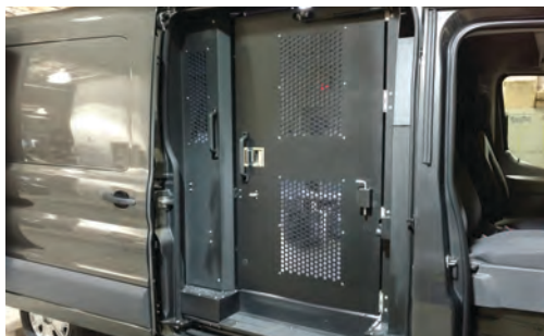
Above: Prisoner transport van shown with optional 2-door entry system and under-seat lighting package.