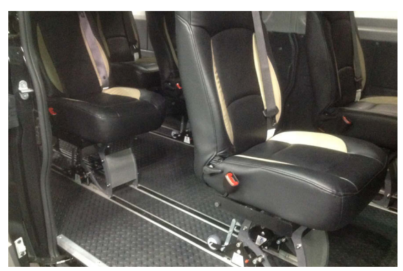
SmartFloor can be used with a variety of popular seating and flooring material options.