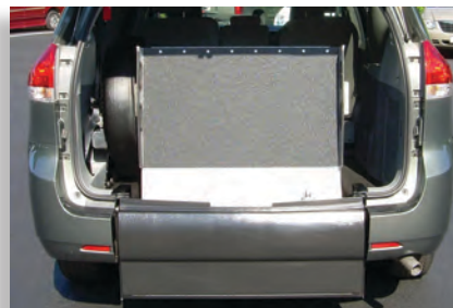
FlexFlat ramp in vertical stowed position.

Installed in hundreds of vehicles since 2014, our exclusive FlexFlat ramp system is an innovative design that folds flat when not in use. It's there when you need it, and folds out of the way when you don't. FlexFlat creates a usable deck that's perfect for luggage, boxes, golf clubs and more.