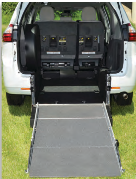
Ramp deployed for wheelchair access.

Installed in hundreds of vehicles since 2014, our exclusive FlexFlat ramp system is an innovative design that folds flat when not in use. It's there when you need it, and folds out of the way when you don't. FlexFlat creates a usable deck that's perfect for luggage, boxes, golf clubs and more.