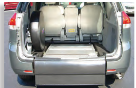
Ramp folded forward with flat deck.