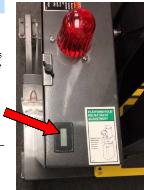
Cycle counter location on a wheelchair lift.

Online videos are available at: Driverge.com/support/product-training-videos